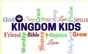
Kingdom Kids: ages 7-9