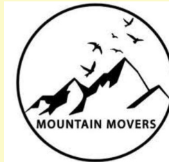
Mountain Movers: ages 10-12

CHILDREN ages 4-12 have no Sunday School classes until September 2021.