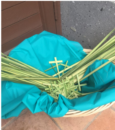
More than 200 palm crosses were made in time for pickup.

A year ago, who would have predicted that St. Stephen's Church would be streaming its Holy Week and Easter services! Yet, we did. Thank you for participating in this new way to be together. Until the time when we can be together again for in-person services and activities, we hope you enjoy these latest photos and comments.