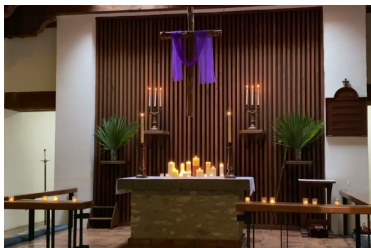
On Maundy Thursday, we were graced with a candlelit service.