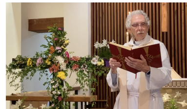
People joined the streamed Easter Service from Texas, California, and Florida.