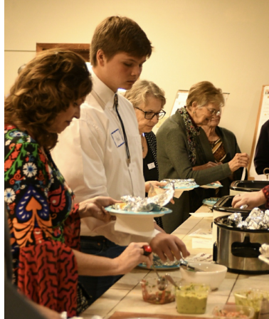
community project create comfort to local families in need during the winter months.

Thank you for eating all those breakfast tacos at the annual meeting! We had around 80 people in attendance and at least twice that amount of breakfast tacos snatched up. Your generosity with this food fundraiser helped the Youth add $700 to their mission trip fund.