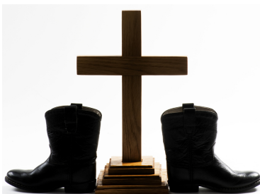
MISSION SUNDAYS @ SSEC

Keep those Texas work boots handy everyone! You will need 'em for our monthly Mission Sundays , a new initiative of the church and school community. It all begins Sunday, April 11, 2021 at 2:00 p.m. in the Courtyard. How it will work is we will gather in the courtyard for a 20-30 minute Holy Eucharist, and then we will hold a church and school-wide outreach project activity. Members of our surrounding community are also welcome and encouraged to join in on the fun the second Sunday of each month.